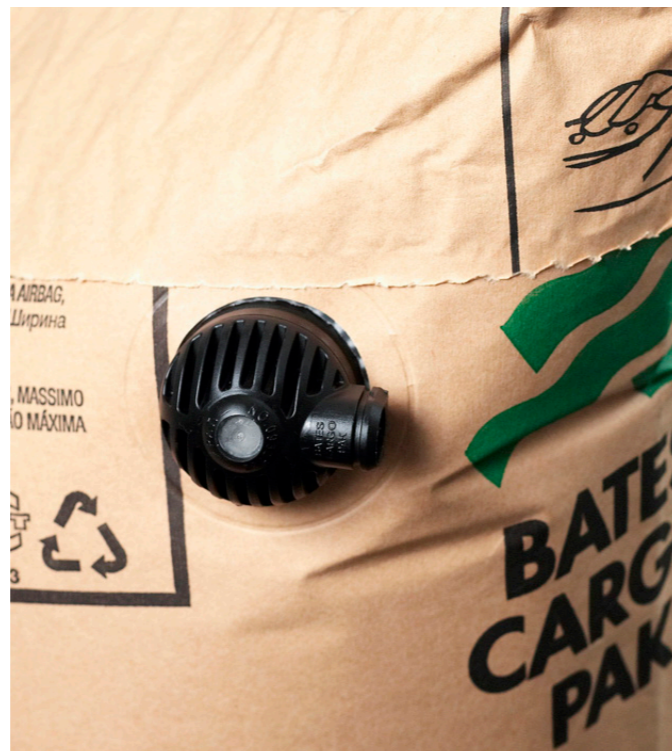
Flex air release valve