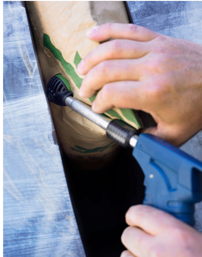
Flex inflator c/w air release